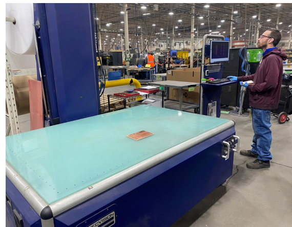
Figure 2: Planar P220.35 measuring a copper part at Monti

The company was introduced to the InspecVision Planar machine by a local InspecVision distributor at FABTECH, North America's largest metal forming, fabricating, welding and finishing event.