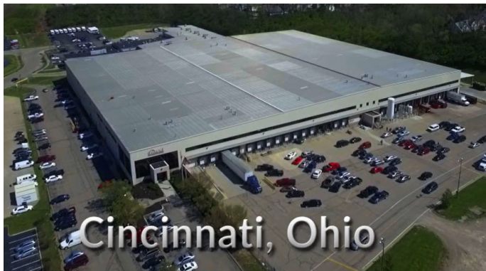
Figure 1: Outside the Monti plant in Cincinnati

Monti Inc is a leading manufacturer and fabricator of copper and aluminium conductors, electrical insulation and steel components for the electrical industry. Services offered include copper bus bar and sheet metal fabrication, CNC machining, stamping, powder coating, die design & build and assembly. With over 30,000 active sku's, Monti completes over 200 sku's daily in a high mix/low volume environment.