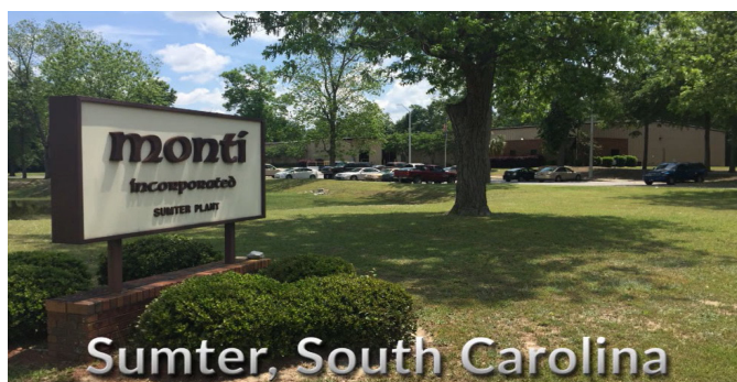
Figure 4: Monti plant in Sumter, South Carolina

For Monti, the main benefits have been the "drastically reduced inspection time" and "eliminating a second employee "buddy checking" the finished part.